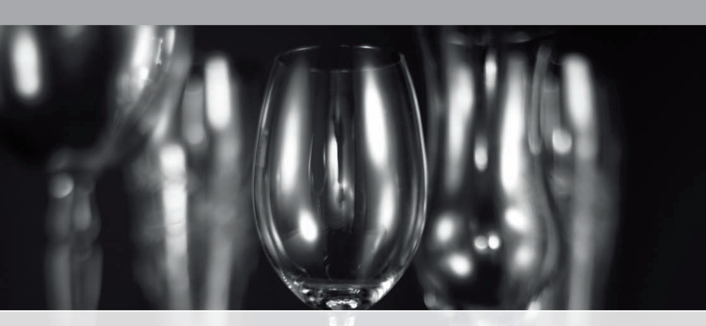
4. WHY ISN'T GLASS JUST GLASS?